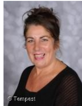
Mrs Norris (Monday, Tuesday, Wednesday)