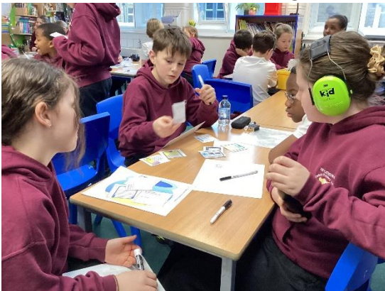
Safer Internet Day went well in school. For example:

This year's theme is protecting yourself from scams online. In school we had a good response to our parents' meeting and everyone learnt something new. It was suggested that we should rerun the session for grandparents and other carers. Date to be arranged soon.