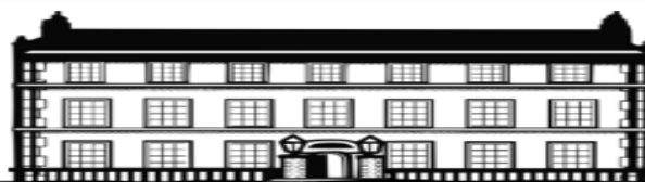
Spring at The Judges' Lodgings Museum