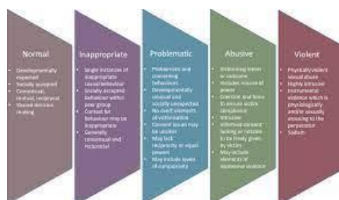
Hackett Continuum of Harmful Sexual Behaviours