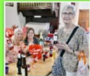
Bottle & Chocolate Tombola's also children's