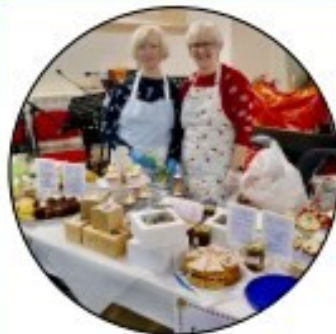
Home Made Cakes