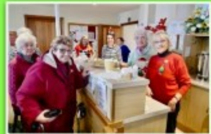
Refreshments including 'Tomlin's Pies'