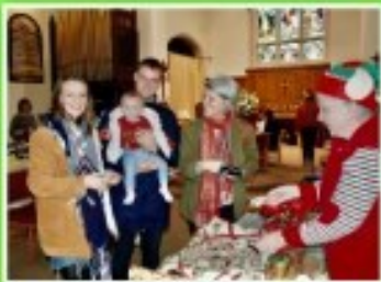
Christmas crafts, gifts, and cards