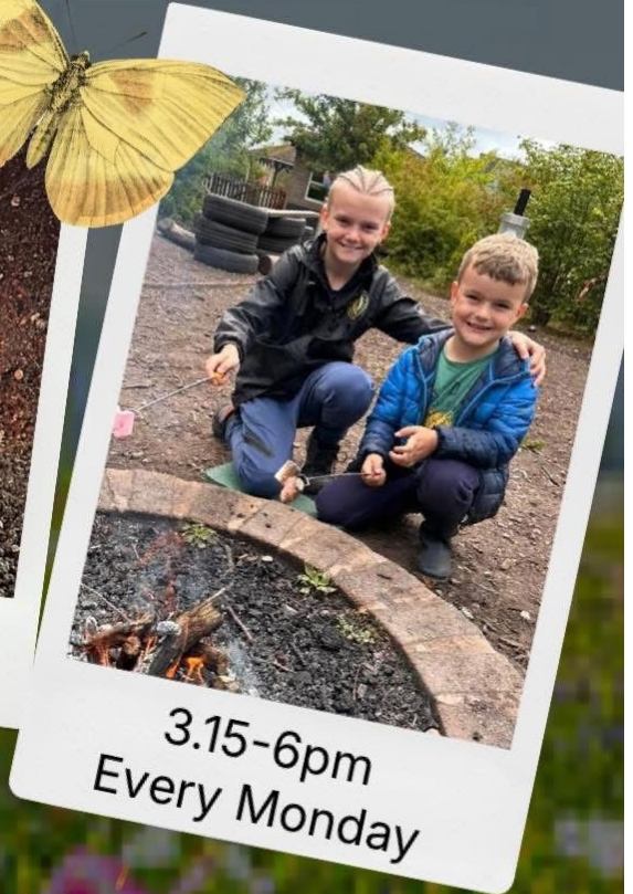
3.15-6pm Every Monday