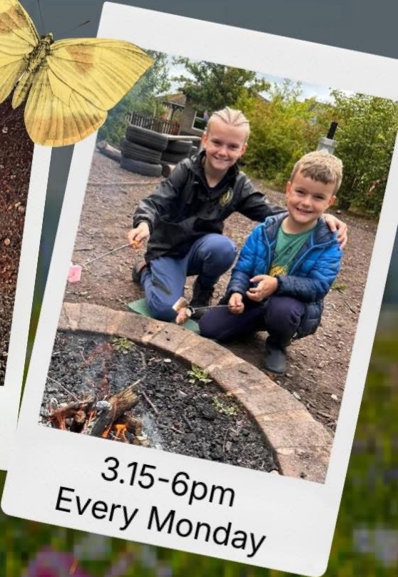
3.15-6pm Every Monday