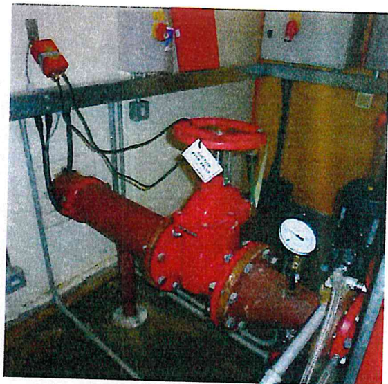
Sprinkler Plant Room & Storage Tank