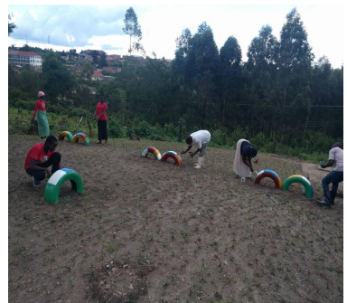
Working to improve the Rehabilitation Centre compound

challenging 'COVID style!' By August a few project patients resumed to go to CoRSU and other hospitals for medical check-up and operations. Also the clubfoot and learning life skill clinics resumed but on a smaller group of 1-3 and individual home visits. Other activities during lockdown include improving the project rehabilitation compound and distribution of food to Kitaz school pupils despite us having to temporarily close our school. Evas