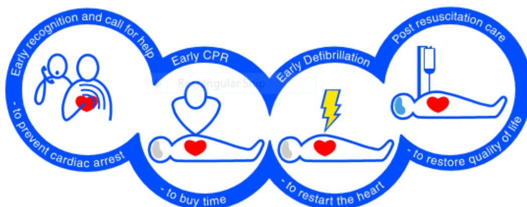
Figure 1: The chain of survival

In the event of a cardiac arrest, defibrillation can help save lives, but to be effective, it should be delivered as part of the chain of survival.