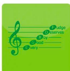
Mnemonics & Rhymes