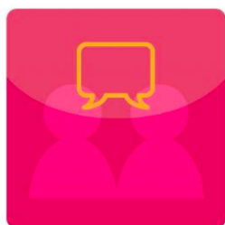
Ask a friend

At CHS South we recognise that all brains work differently and that you might need to try different methods of revision before you find the right fit for you. Below are some examples of tried and tested methods that we have successfully used with students at CHS South. Work your way through them and see which method/s help you to retain the most information!