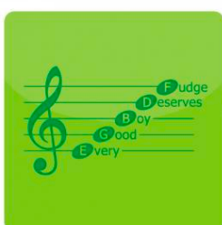
Mnemonics & Rhymes