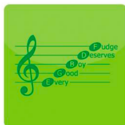
Mnemonics & Rhymes