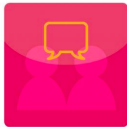
Ask a friend

At CHS South we recognise that all brains work differently and that you might need to try different methods of revision before you find the right fit for you. Below are some examples of tried and tested methods that we have successfully used with students at CHS South. Work your way through them and see which method/s help you to retain the most information!