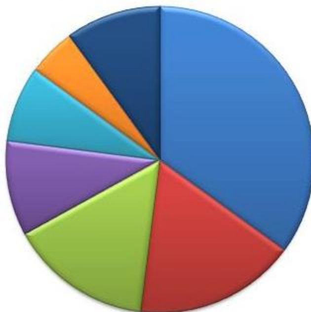
Market share in the UK supermarket industry