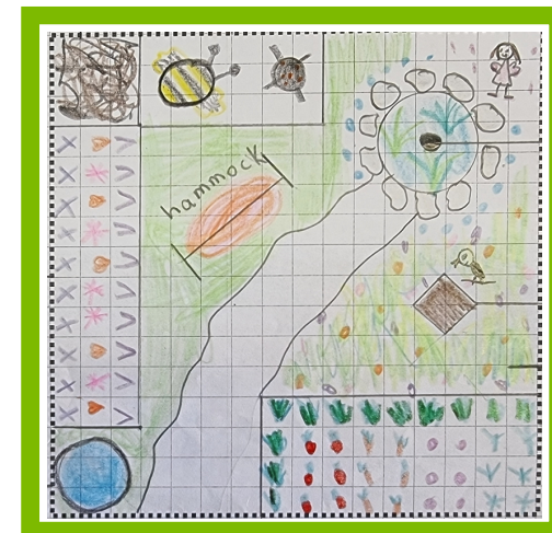
2022 joint-winning school's design

The Schools Design-a-Garden Competition winner, their family and teachers will be invited as our special guests to the Show for the presentation. We will also be donating £200 gardening vouchers to the winning school to enhance their school ground and setting.