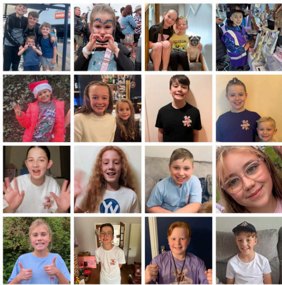
Our Crazy Pups Team!

The Crazy Pups will lead the way by running the 1K children's race, and there's already have a brilliant group of young runners signed up and ready to go, they are pictured below. They'll be followed by an amazing team of around 60 adults taking on the Mad Dog 10K.