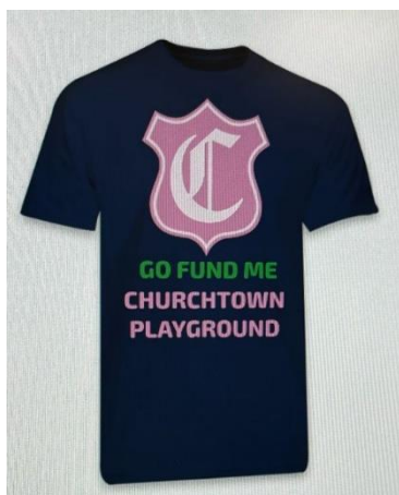
Front of T-Shirt Design