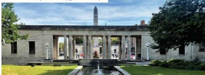
The parade will form up at Victoria Park from 10:30, departing 11:15. The service will begin at the War Memorial at 12:00.

Churchtown Primary School have been invited to attend an event that is being held to mark the rededication of the War Memorial in Southport.