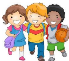
Friendships and social skills