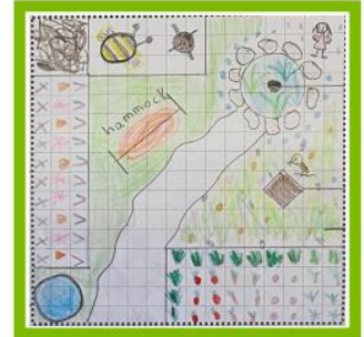
2022 joint-winning school's design

The Schools Design-a-Garden Competition winner, their family and teachers will be invited as our special guests to the Show for the presentation. We will also be donating £200 gardening vouchers to the winning school to enhance their school ground and setting.