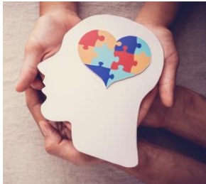
'Making wellbeing a priority at Churchtown'

In order to raise the profile of mental health and wellbeing, every class in school will be delivering a PSHE lesson with a focus on mental health, using a variety of activities.