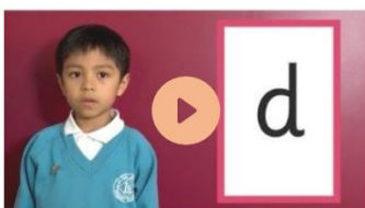
Phase 2 sounds taught in Reception Autumn 1

https://www.littlewandlelettersandsounds.org.uk/resources/for-parents/