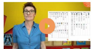
Phase 5 sounds taught in Y1