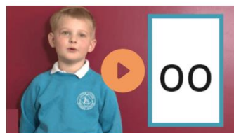
Phase 3 sounds taught in Reception Spring 1