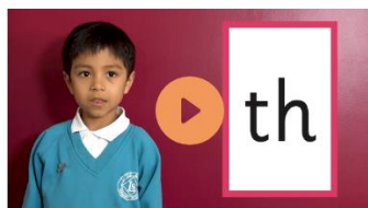
Phase 2 sounds taught in Reception Autumn 2