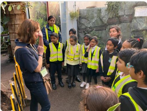
Year 3 trip to the Living Rainforest

High quality core texts are used to bring these themes to life and children are provided with a variety of opportunities for geography learning inside and outside of the classroom.