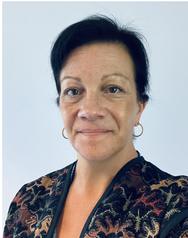
1 - Message from Emma Brown