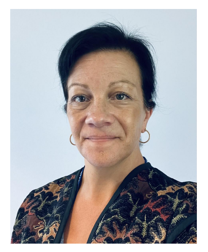
1 - Message from Emma Brown