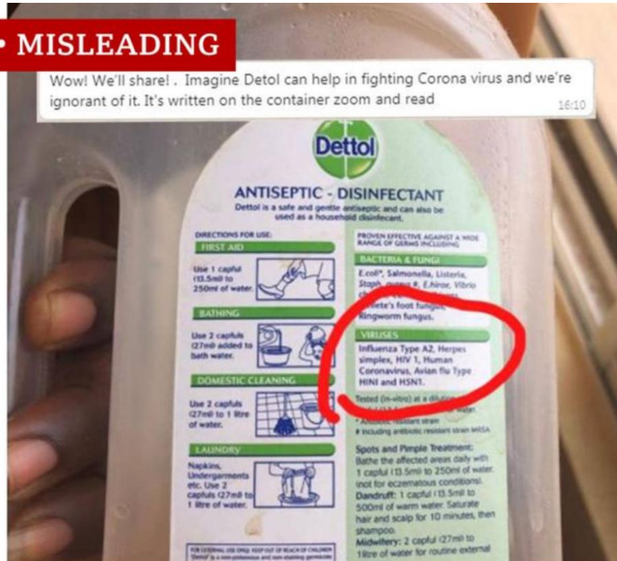
We have added labels to the screenshots to indicate whether the story has been found to be "misleading", "false" or using an "old photo".

Wow! We'll share! . Imagine Dettol can help in fighting Corona virus and we're ignorant of it. It's written on the container zoom and read 16:10