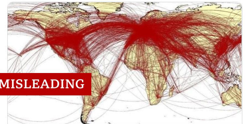
Horrifying new map reveals no country safe from coronavirus' deadly tentacles A HORRIFYING new map shows the unstoppable spread of deadly coronavirus across the globe. The incredible graphic reveals how five million Wuhan resident... thesun.co.uk

Horrifying new map shows no country is safe from coronavirus' deadly tentacles