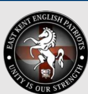
East Kent English Patriots