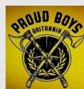
Proud Boys Britannia