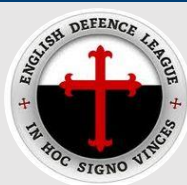
English Defence League