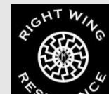
Right Wing Resistance