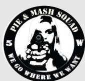
Pie & Mash Squad