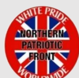
Northern Patriotic Front