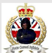
Notts Casual Infidels