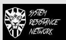
Systems Resistance Network