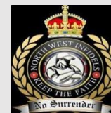
North West Infidels