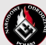
National Rebirth of Poland