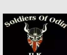
Soldiers of Odin