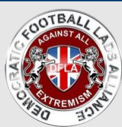
Democratic Football Lads Alliance