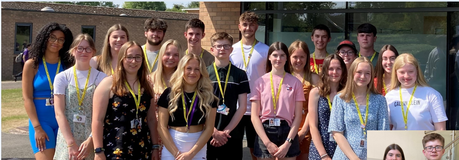
Above: Our 2022-23 Student Leadership Team