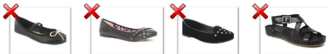
Ballet, pump style shoes with coloured bows, jewels or other embellishments.