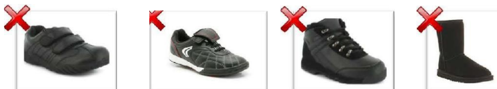
Trainer-style casual shoes

The following shoes are NOT acceptable items of school uniform: