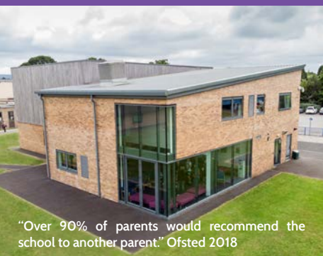
“Over 90% of parents would recommend the school to another parent.” Ofsted 2018

The latest addition to our facilities are four fantastic, full size outdoor table tennis tables, which have been a great success with students and staff alike.