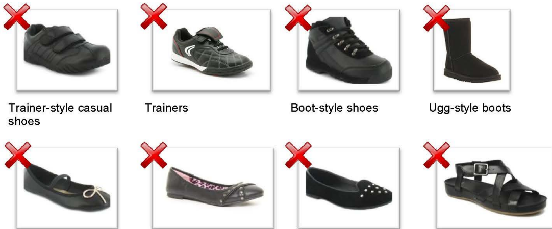
Trainer-style casual shoes

The following shoes are NOT acceptable items of school uniform: