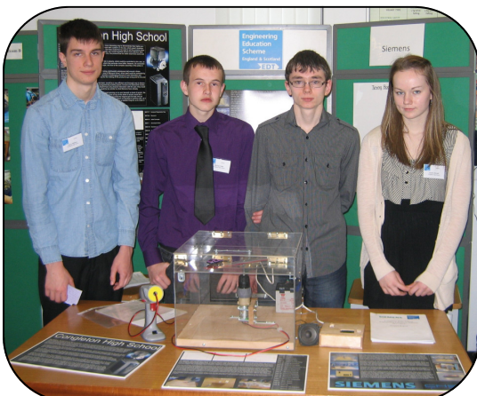
Engineering Education Scheme Team