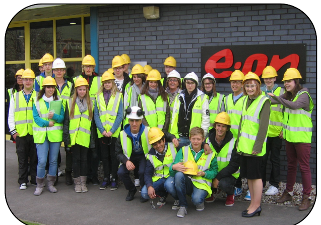
Comenius visit to Connahs Quay