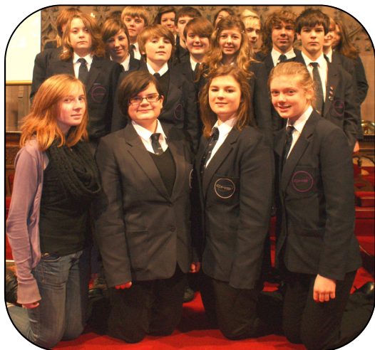
Members of the school choir