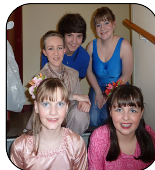
Students in Pantomime

If your son or daughter has similarly achieved and you are proud of it, please send photographs and information to staffpaf@congleton.cheshire.sch.uk .