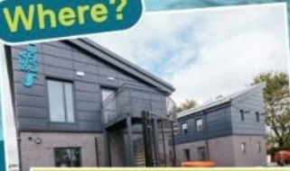
Midlands Boat Station