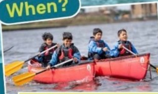
Weekdays from July