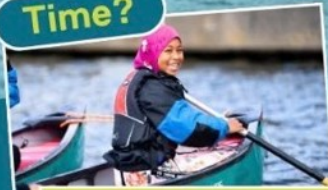
Mornings & afternoons