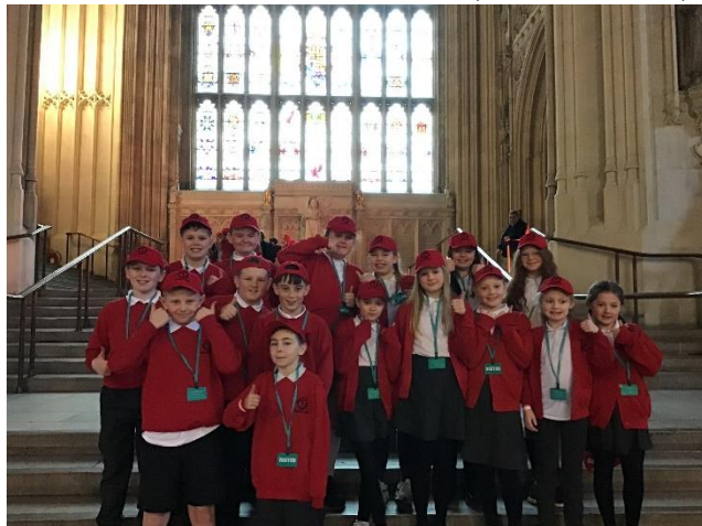
please have a look at them 😊