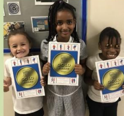
INDIVIDUAL SKIP WINNERS

Year 2 took part in the Leeds City Skipping Competition this week. They scored gold in both group events and picked up an array of bronze, silver and gold certificates in the individual skips. All children represented the school beautifully and were praised by the skipping school for their impeccable manners.