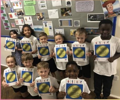
KEEP THE POT BOILING WINNERS