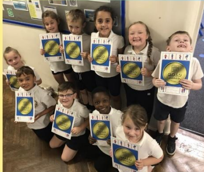
RUN JUMP OUT WINNERS