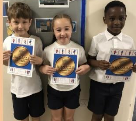
INDIVIDUAL SKIP BRONZE AWARD