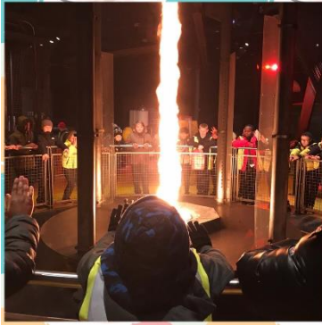
More pictures from Magna Science Museum.