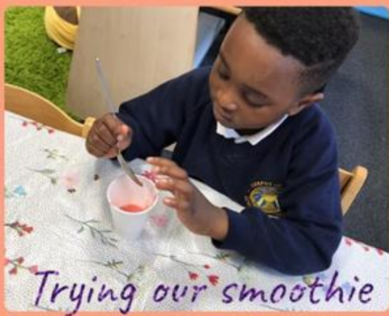
Trying our smoothie

This week, the children in Provision Class created a smoothie using different soft fruits. The children enjoyed chopping the fruit and adding them to their smoothie. When the smoothie was made, the children all smelt and tried it.