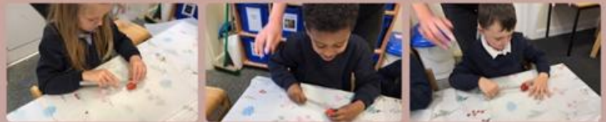
Chopping fruit for our smoothie