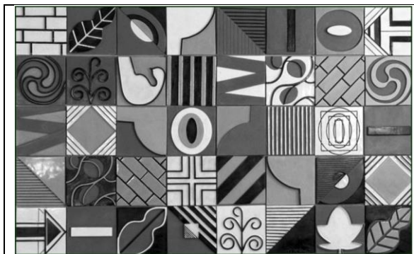
Suite in Grey