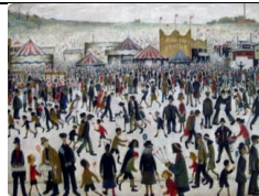
Lancashire Fair, Good Friday, Daisy Nook, 1946 by LS Lowry