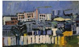
Factory Buildings, Leeds - 1965 by Joash Woodrow