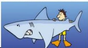
Man eating shark

Hyphens are used to avoid confusion being caused by certain words or phrases::