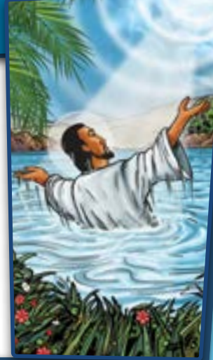
Taken from the Gospel of Sunday 10 th January 2021 Mark 1:7-11 (the Baptism of the Lord, Year B)

When John the Baptist was preaching he said, "Someone is following me, someone who is more powerful than I am, and I am not fit to kneel down and undo the straps of his sandals. I have baptised you with water, but he will baptise you with the Holy Spirit." It was at this time that Jesus came from Nazareth in Galilee and was baptised by John in the River Jordan. No sooner had Jesus come up out of the water than he saw the heavens torn apart and the Spirit, like a dove, descending on him. Then a voice from heaven said, "You are my son, the Beloved; my favour rests on you."