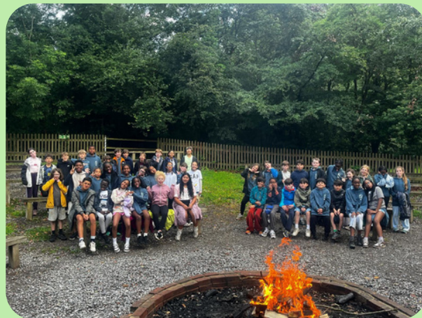
Year 6 final night around the camp fire.

The Year 6 children are returning this afternoon after a fabulous week in Gilwell Park, Essex. We are looking forward to hearing about all their adventures next week when they are back in school. We thank all the staff who have volunteered to take the children away, as these trips cannot take place without them and to the teachers for leading the organisation of these trips. We finally thank parents for the trust you give to the school to enable us to give your child a wonderful experience away. You can see all their adventures on our Instagram page corpus_christi_brixton