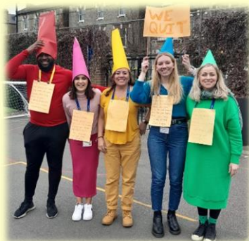
The day the Crayons quit school!!!