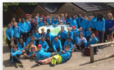
Year 6 rounding off the end of a fantastic week at PGL.

Congratulations to Classes 4, 6, 13 & 14 on their 100% attendance.