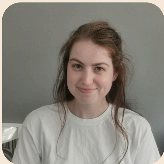
Miss Nottle Class 7

Diary dates are published on our website, please do check as changes are sometimes necessary.