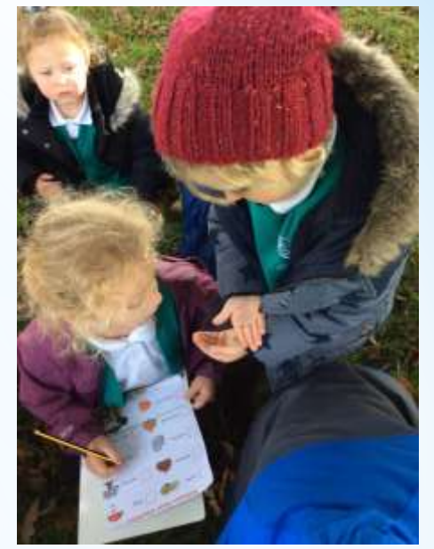
Specific- Understanding the World People and communities, the world, technology