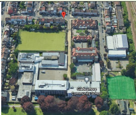
Google Earth image of Crowland Primary