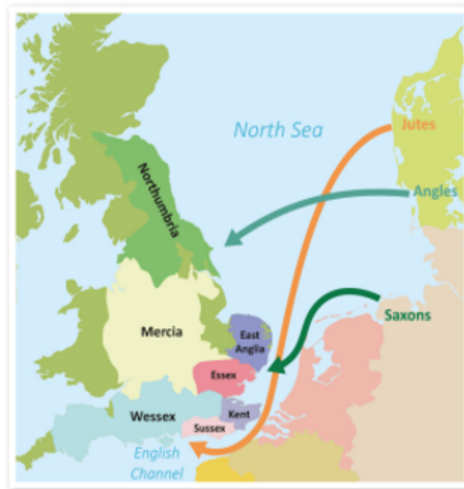
Map showing the different invasions of Britain and the Anglo-Saxon seven kingdom divide

During the Roman rule of Britain, tribes from Denmark and Germany attempted to invade Britain. The Romans built shore forts on the east and south coasts of England to protect themselves from invasion. After the Romans left in AD 410, three tribes called the Angles, Saxons and Jutes invaded England. They attacked and killed Britons or caused them to flee to Cornwall, Wales or Scotland. By AD 600 the invaders had claimed England as their own country and divided it into seven kingdoms. Each kingdom was ruled by an Anglo-Saxon king.